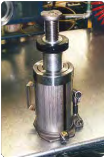
Bottle jack with lock nut