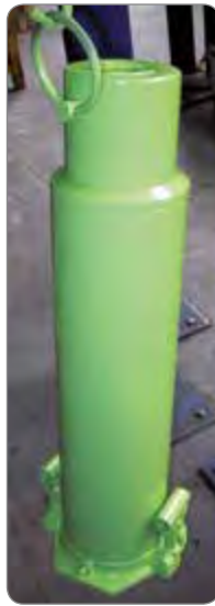
50 Tn, 2 speed, long stroke bottle jack